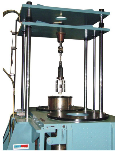
HONING MACHINE (VERTICAL TYPE)