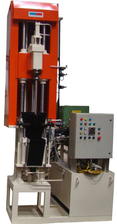
VERTICAL HONING MACHINE VHM - 500